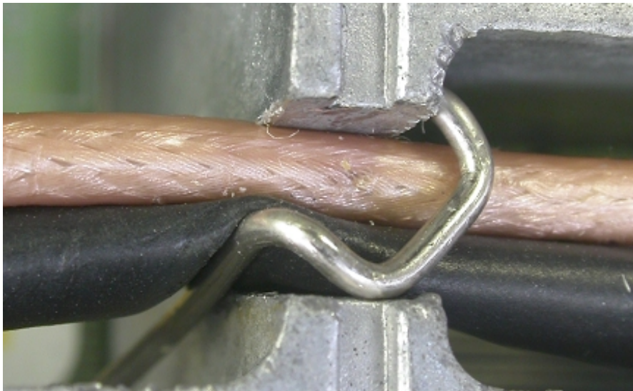
Figure 3. Cables passing through the channel without crimping against sharp edges.

Care must be taken when applying clips as to not have any part of the ribbon cable caught between the clip and the chassis wall.